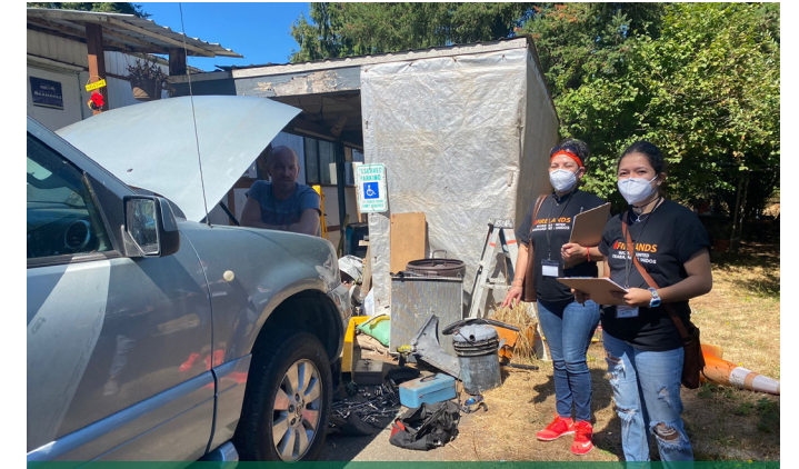
Firelands canvassers conducting the survey with local workers in rural WA.

74% would take a job to Rebuild Timber Country for working families