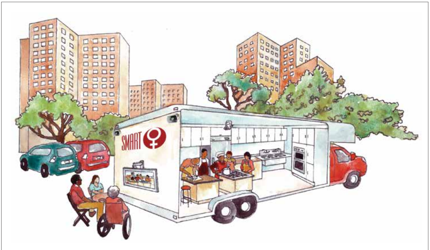
A view inside the commercial kitchen classroom, with a live broadcast of the class being screened outside the vehicle.

The Mobile Cooking Classroom has incorporated the ideas and voices of community residents from the start. Inspired by self-assessments of SMART Body participants, we wanted to share these life-changing experiences to help build a stronger, healthier community. SMART was given that opportunity through the Participatory Budgeting (PB) initiative. In spring 2013, the Mobile Cooking Classroom was 1 of 6 winning projects through PB in District 8, and was approved by Council Speaker Mark-Viverito for capital funding! We then reached out to Hester Street Collaborative, another community based organization that specializes in large community engagement projects, to assist us in making our vision a reality for this innovative, custom-designed Mobile Cooking Classroom.