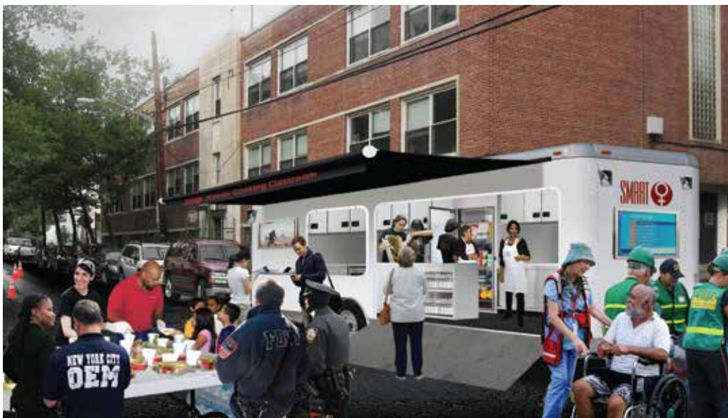
The Mobile cooking classroom being used as a Community Preparedness Response vehicle during an emergency.

SMART is working alongside the American Red Cross, other city-wide coordinating networks and private sector entities dedicated to emergency preparedness. With the CPR vehicle, we will be able to respond to the specific dietary needs of special populations.