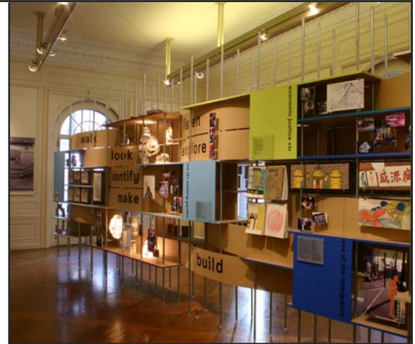
Above: exhibition installation; below: HSC interactive cards

Additionally, HSC has organized two events in conjunction with a current Ground Up program geared toward designing and building a new garden with the students and neighboring community at PS 134 on East Broadway and Grand Street on the Lower East Side. The first event, developed in partnership with the Project for Public Spaces will take place on March 13 th at PS 134-- it will be a visioning session for local stakeholders, which will attempt to create a forum for all parties to brainstorm possibilities for the new Garden at PS 134. The second event, to be held at the Urban Center on March 23 rd 2006, will be a design charrette run by HSC with garden design consultant, Pete Moss, from the Audubon Society; Landscape architect, Rachel Gleeson from Michael Van Valkenberg, Associates; Thor Snilsberg from Project for Public Spaces; and with graphic design assistance from Metropolis magazine. The design charrette will be an opportunity for local stakeholders (students, teachers and community members) to collaborate with experts to redesign their garden space.