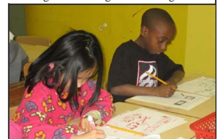
Students create an alphabet for their library walls

The Robin Hood Foundation has approached HSC to develop and coordinate collaborative student-teacher workshops for their prestigious L!brary Initiative, currently in the design and planning stages of a cohort of twenty six new libraries. Leroy Street Studio is one of six architecture firms currently working on the design of these libraries. HSC is working with the Robin Hood organization, with school administrators and teachers, with the selected architects, with the program's graphic designers, Pentagram, and visiting artists-- to generate design education tools, lesson plans, teacher training strategies, and long-term programming. HSC has developed workshops designed to engage students and teachers in the creation of graphics and architectural elements for their library. By engaging students and teachers in the final design of their school library, HSC and Robin Hood seek to build personal investment in the well-being and future use of those spaces. For HSC this presents a unique opportunity to refine and develop their collaborative design/build strategies, working with a range of designers and students in varying contexts on a similar design problem.